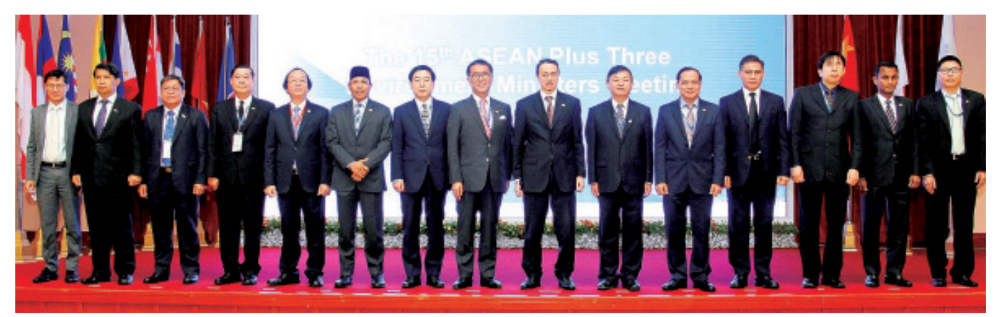
The Minister of Development, Yang Berhormat Dato Seri Setia Awang Haji Bahrin bin Abdullah at the 15th EMM + 3 Ministerial Meeting on the Environment held at the International Conference Centre.

BERAKAS, September 13 - Through the ASEAN +3 Environmental Ministerial Meeting it is hoped that it will result in a more beneficial and productive collaboration, especially in promoting environmental cooperation between ASEAN and +3 partners as well as welcoming other potential collaborations in the field of environment in the future.