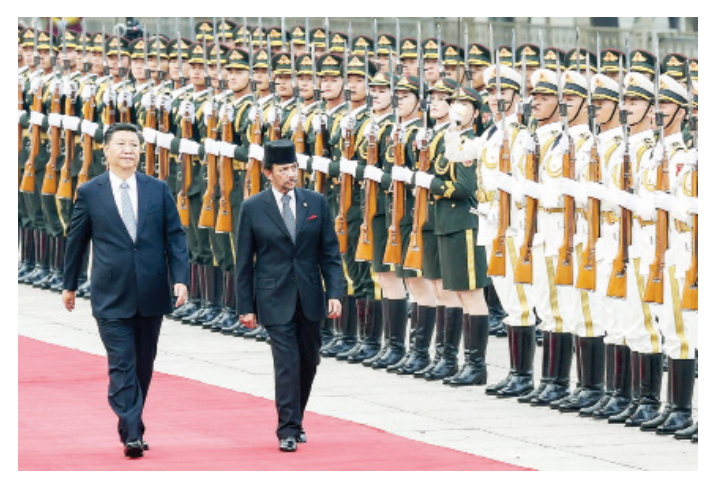
His Majesty inspecting the Guard of Honour mounted by the People's Liberation Army.