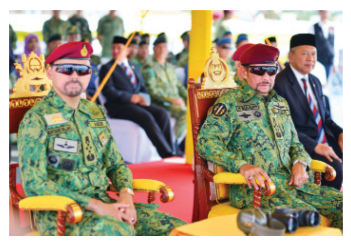
His Majesty Sultan Haji Hassanal Bolkiah Mu'izzaddin Waddaulah ibni Al-Marhum Sultan Haji Omar 'Ali Saifuddien Sa'adul Khairi Waddien, Sultan and Yang Di-Pertuan Brunei Darussalam, Minister of Defence and Supreme Commander of the Royal Brunei Armed Forces (RBAF) consents to grace RBAF's 56th Anniversary celebration held at the Royal Brunei Navy (RBN) Base in Muara. Accompanying His Majesty was His Royal Highness Prince General Haji Al-Muhtadee Billah, the Crown Prince, Senior Minister at the Prime Minister's Office and General of the RBAF.

strengthening their internal defence, including spiritual and religious resilience in the face of the deviation of ideology.