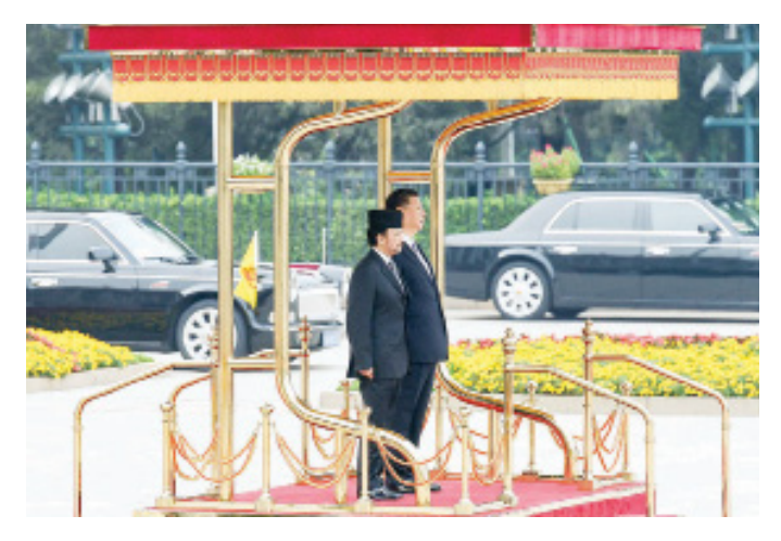
His Majesty receiving the Official Salute, accompanied with the playing of the national anthems of Brunei Darussalam and the People's Republic of China and a 21 gun salute.